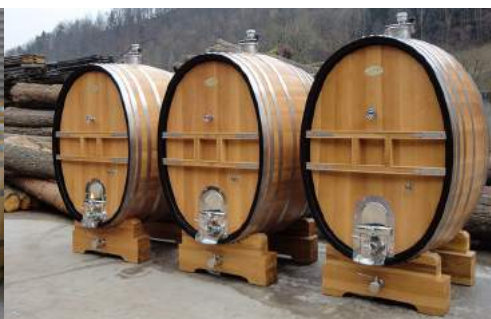
25 HL oval casks destined for South Africa.