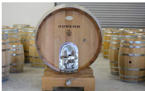
15 HL round cask destined for Oddero in the Piedmonte.

Schneckenleitner has built their reputation on the production of their large format ovals and puncheons which are found in many of Europe's finest cellars. Because of the large format, the incredibly long and low toast, and significantly long air-drying time results in extremely low impact ovals, rounds and puncheons that respect the wine's fruit, freshness and minerality, while allowing for some natural micro-oxidation to occur. Their large format vessels work both on white and red wines.