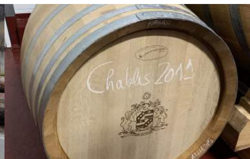
45 mm thick stave 500L puncheon in Chablis.