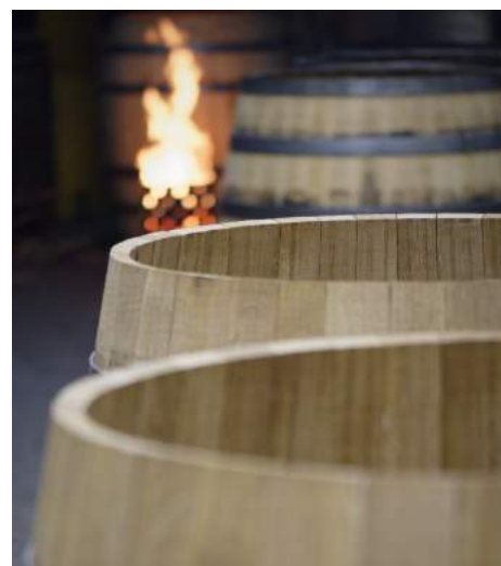
Barrels toasting at the cooperage in Bordeaux.

Maury barrels focus on fruit purity, expression, aromatics and structure. The barrels allow the fruit to remain in focus while providing lift and fullness. They are delicate enough for a lighter vintage but have enough personality and impact to excel in warmer vintages and richer wine styles.