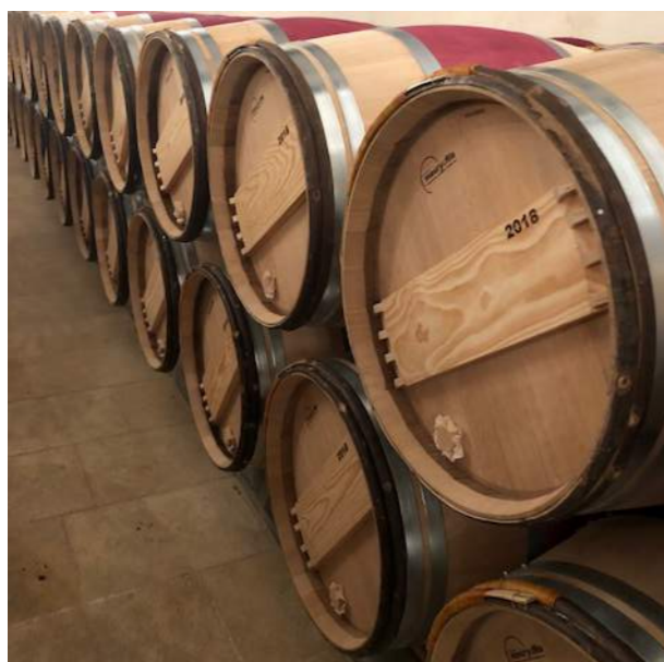
Row of Maury medium toast Bordeaux Chateau barrels at Château Léoville-Barton in St. Julien.